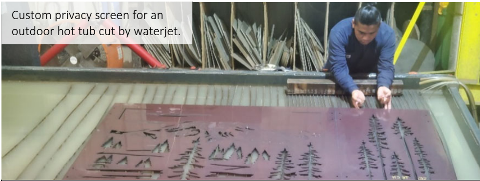
Custom privacy screen for an outdoor hot tub cut by waterjet.